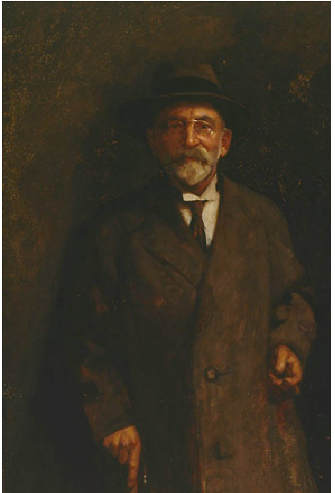
Florence Rodway, Jules Francois Archibald 1921 Art Gallery of NSW