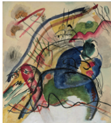
Study for 'Painting with white border' (Moscow) 1913 by Wassily Kandinsky

Wassily Kandinsky Study for 'Painting with white border' (Moscow) 1913 watercolour, gouache, ink, 39 x 35 cm, Collection: Art Gallery of New South Wales. Purchased 1982 © Wassily Kandinsky/ADAGP. Licensed by Viscopy, Sydney.