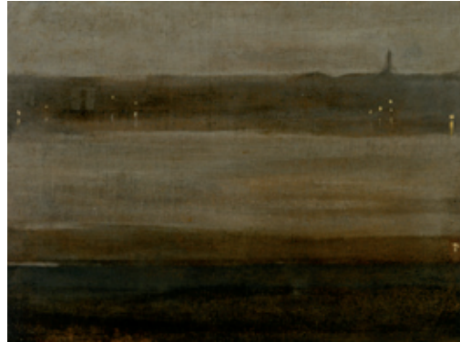
Nocturne in grey and silver, the Thames , c1873 by Whistler.

James Abbott McNeill Whistler Nocturne in grey and silver, the Thames , c1873 oil on canvas, 44.7 x 60.3 cm Collection: Art Gallery of New South Wales. Purchased 1947