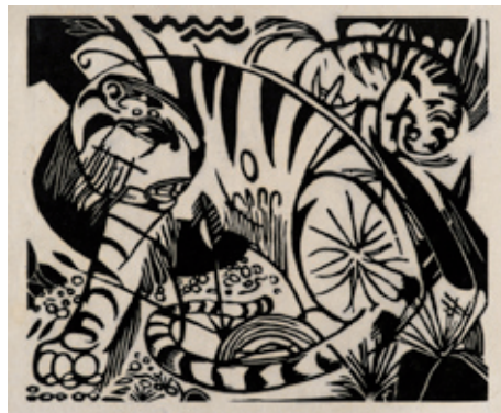
Tiger by Franz Marc

Franz Marc Tiger 1912 woodcut, 20 x 24.1 cm Collection: Brooklyn Museum of Art, Ella C Woodward Memorial Fund