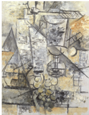
Glass of absinthe 1911 by Georges Braque.

Georges Braque Glass of absinthe 1911 oil on canvas, 37 x 28.7 cm Collection: Art Gallery of New South Wales. Purchased 1997 © Georges Braque/ADAGP. Licensed by Viscopy, Sydney.