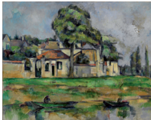
Banks of the Marne , c1888 by Paul Cézanne.