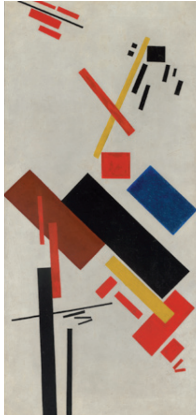
House under construction 1915–16 by Kasimir Malevich

Kasimir Malevich House under construction 1915–16 oil on canvas, 97 x 44.5 cm Collection: National Gallery of Australia, Canberra. Purchased 1974