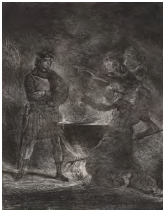
Eugène Delacroix 1798–1863 Macbeth consulting the witches 1825, lithograph, 32 x 25 cm Purchased 2008; A-R-T/Shutterstock

Invent a spell you could mix in this bubbling cauldron and write the list of ingredients you will need.