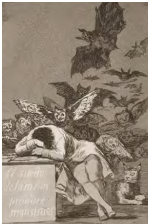
Francisco de Goya 1746–1828 The sleep of reason produces monsters 1797–98, etching and aquatint, 21.5 x 15 cm. Purchased 1978

Draw more creatures of the night that could surround Goya.