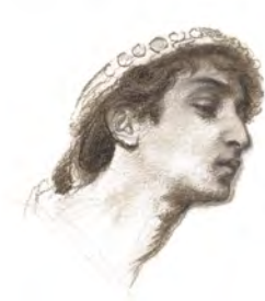
Sir Edward John Poynter 1836–1919 Study for the head of the Queen of Sheba mid 1880s, black and white chalk on brown paper, 22.5 x 19.5 cm sheet. Purchased 1975

At home sketch people you know in different poses and plan and create a painting based on your practice drawings.