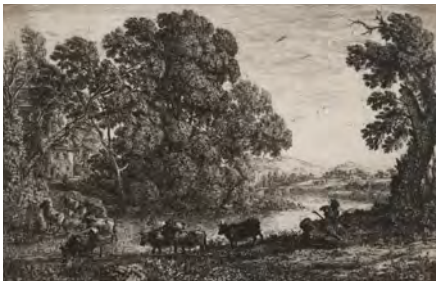
Claude Lorrain 1600–82 The cowherd 1636, etching 12.8 x 19.9 cm. Bequest of Tom Roberts 1931

At home go outdoors and draw or paint scenes of trees and nature.