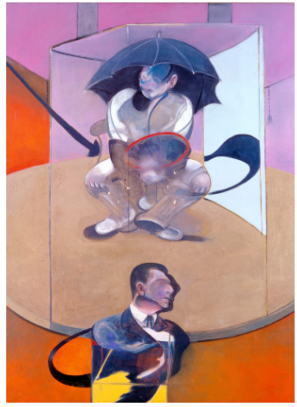
'There's no-one really like him ... I think he took [painting] to a new level.'