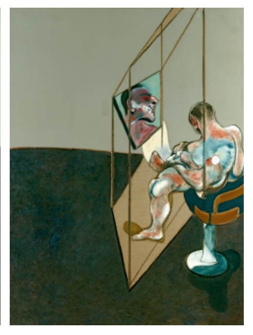
Three studies of the male back, triptych 1970 Kunsthaus Zürich, Vereinigung Zürcher Kunstfreunde