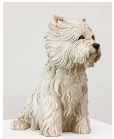
Jeff Koons White terrier 1991, synthetic polymer paint on wood John Kaldor Art Collection