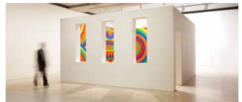
The new John Kaldor Family Gallery with Sol LeWitt Wall drawing #1091: arcs, circles and bands (room) 2003 © Estate of Sol LeWitt/ARS. Licensed by Viscopy, Sydney

The new floor of some 3,300 square metres comprises the John Kaldor Family Gallery, a suite of contemporary and modern galleries, a dedicated photography gallery, and a study room for the Gallery's work on paper collection.