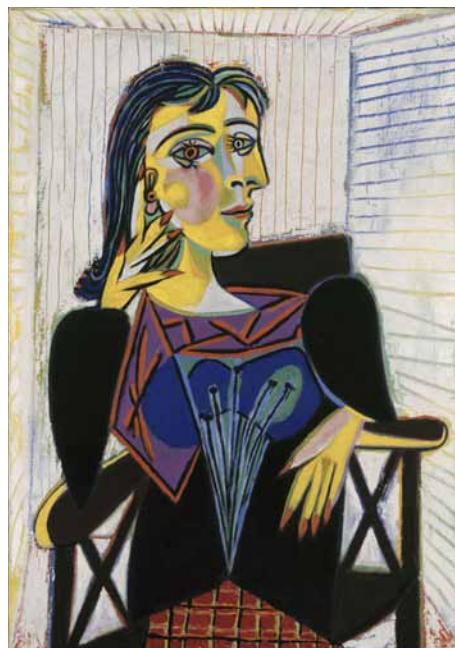
Pablo Picasso Portrait of Dora Maar 1937 Collection Musée Picasso, Paris © Succession Picasso, photo © RMN/Jean-Giles Berizzi

Drawn from the collection of the Musée National Picasso in Paris – the largest and most important repository of the artist's work in the world – the exhibition will feature more than 200 extraordinary paintings, sculptures, drawings, prints and photographs. This unprecedented opportunity is possible at this time because the Musée Picasso has recently closed for renovations, allowing a global tour of this full-scale survey to travel for the first and, very likely, the only time.