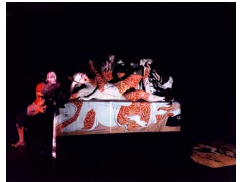
Eikoh Hosoe Ukiyo-e projections # 2–36 2003

This exhibition brings together three seminal series by Eikoh Hosoe, a leading figure in modern Japanese photography. Taken over forty years, Kamaitachi (1965–68), The Butterfly Dream (2006) and Ukiyo-e Projections (2002–03) are driven by Hosoe's longstanding fascination for the revolutionary dance movement Butoh and for its charismatic founders Tatsumi Hijikata and Kazuo Ohno. Together these series epitomise his unique style that combines photography with elements of theatre, dance, film and traditional Japanese art.